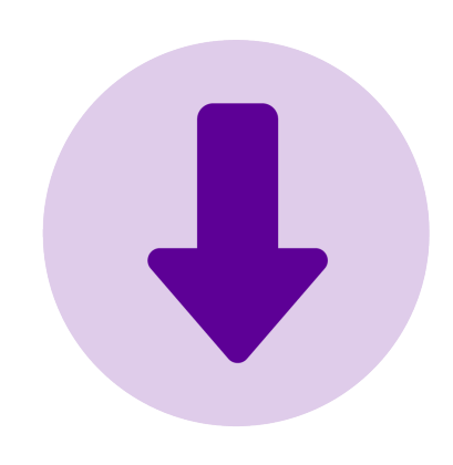
Stop the liver from making and releasing too much sugar