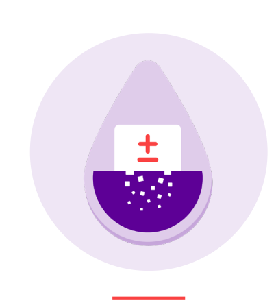
The body release insulin when blood sugar is high