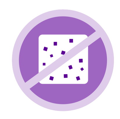
The body remove excess sugar from the blood